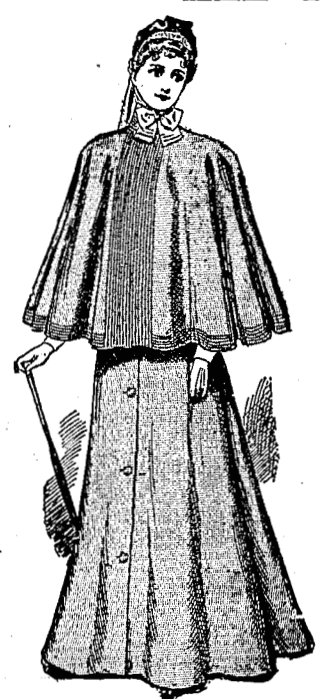
The "Rosemary" Cloak, 26/6. Made of all wool Cheviot Serge, thoroughly shrunk.

Containing List of Nursing Books, with full Discount, Collars, Caps, Bonnets, Cloaks, Midwifery Bags, Dress Baskets, Ward Shoes, Thermometers, Instruments, Diet and Temperature Charts, &c. SHOULD CONSULT NURSES