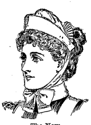
"Sister Dora" Cap. Made of washing Cambric, with draw strings. Can be washed as easily as a handkerchief. 1/-. Without strings, 101d.