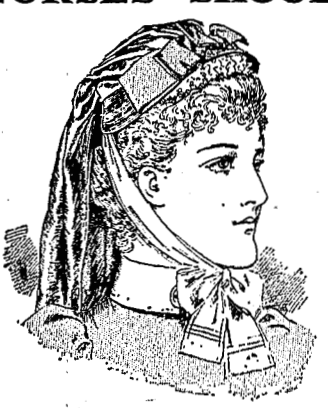
The "St. Bride's" Bonnet. Made of fine Straw with Lace and ruching, and trimmed with Ribbon, and long Silk Gossamer Fall. In black and colours, 12/6 each. Without Fall, 9/6; also The "St. Clare" Bonnet. 6/11 complete.